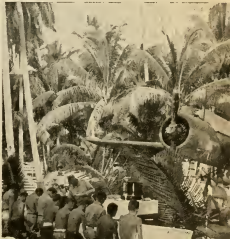
In lands afar, servicemen are seeing foreign missions at firsthand